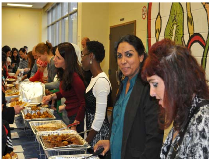
Left: Volunteer and staff serving food to guests. Right: Volunteers and staff handing out holiday gifts.

CCVT was pleased to host over 200 clients, staff, board members and volunteers at the 2010 Annual CCVT General Meeting and Holiday Party Sunday Dec. 12 th at the Bickford Centre. The event included the election of new board members, a delicious meal featuring food from all over the world, gifts for the kids and dancing. CCVT clients were also happy to display and sell the handmade crafts, jewelry and clothing. Thank you to everyone who donated food, gifts and their time to make this event a success. Hundreds of gifts generously donated in part by the CHUM City Christmas Wish and volunteers were lovingly wrapped by volunteers and brought smiles to the faces of the children.