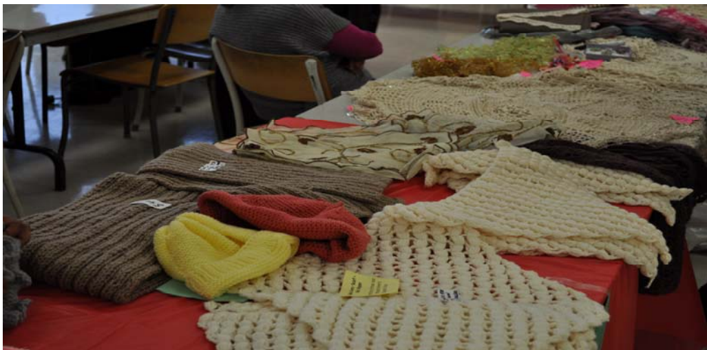
Knits for Sale at Holiday Party

CCVT was pleased to host over 200 clients, staff, board members and volunteers at the 2010 Annual CCVT General Meeting and Holiday Party Sunday Dec. 12 th at the Bickford Centre. The event included the election of new board members, a delicious meal featuring food from all over the world, gifts for the kids and dancing. CCVT clients were also happy to display and sell the handmade crafts, jewelry and clothing. Thank you to everyone who donated food, gifts and their time to make this event a success. Hundreds of gifts generously donated in part by the CHUM City Christmas Wish and volunteers were lovingly wrapped by volunteers and brought smiles to the faces of the children.