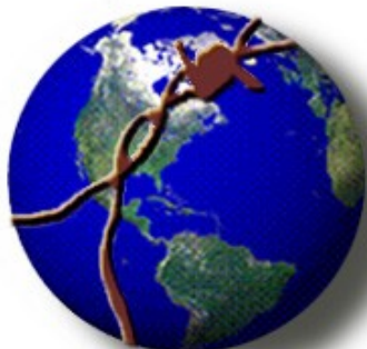
Helping Survivors of Torture Since 1977

The CCVT Connection , which is published monthly, is intended to inform and engage the Centre's volunteers in important events, news, and meetings, and in doing so, to acknowledge the vital role they play in fulfilling the CCVT's mandate.