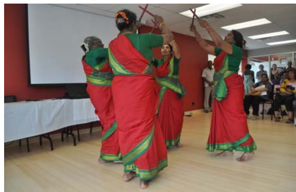
CCVT Tamil Seniors performing at the June 26 Celebrations