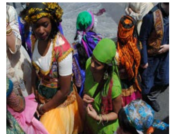
Sashar Zarif Dance Performers, York University—Yonge/Dundas Square

World Refugee Day is a great occasion to celebrate the resilience of refugees, many of whom call Toronto their new home. The day was also a good opportunity for all those concerned with refugee issues to come together and celebrate not only the refugees, but the organizations that support them.